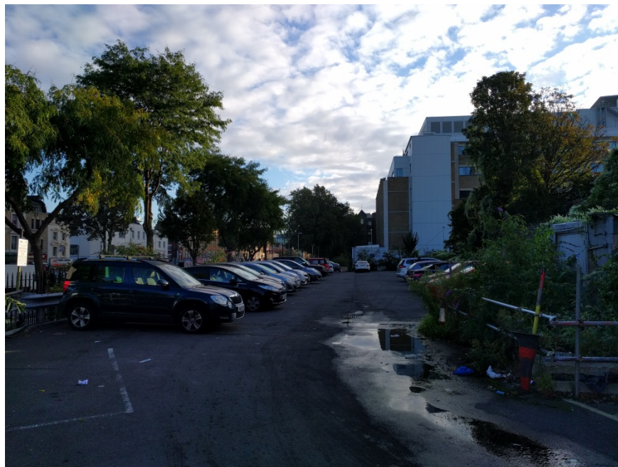
Fig.1: Application site.