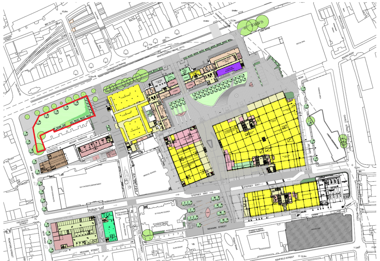
Fig. 2: Hospital Redevelopment Consent: Application site outlined in red.